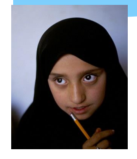
If your child wears a headscarf, it should be plain white, navy or black.